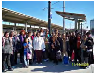
Women's Ministry On The Move For Christ

In partnering with our Pastor to win souls for Christ, the women of Paradise embarked on a mission to share Christ beyond our community. We boarded the Amtrak train to Sacramento to complete our mission for the day. Our trip was exciting and